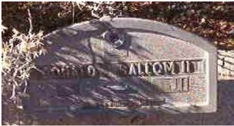
Photo shows no birth or death info.