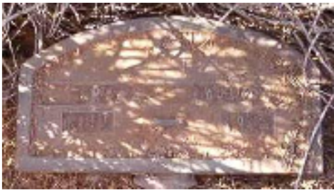
Photo not clear enough to read year of death.