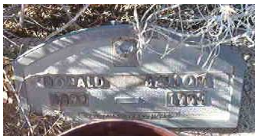
Photo not clear enough to read year of death.